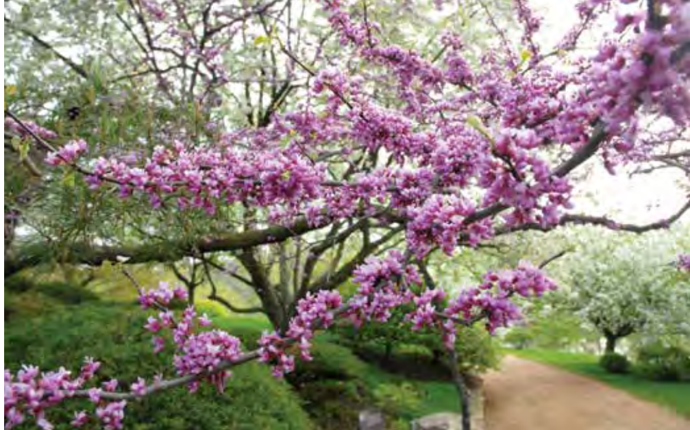
Flowering trees capture the magic of spring.