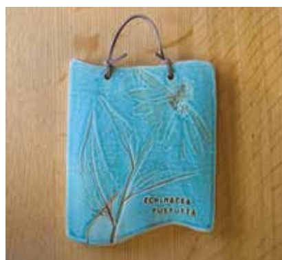
Create six original plant markers for your garden.