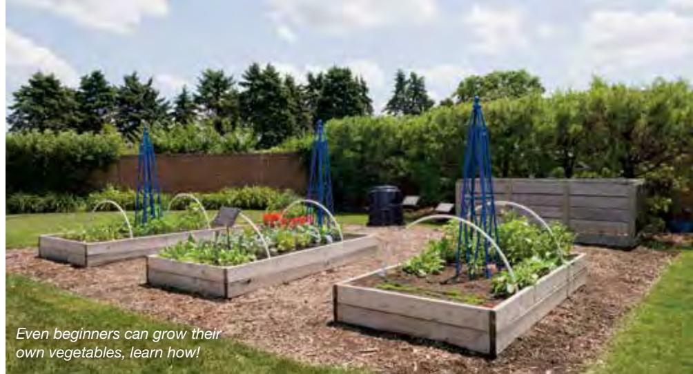
Even beginners can grow their own vegetables, learn how!

Chicago Botanic Garden members receive a 20 percent discount on classes.