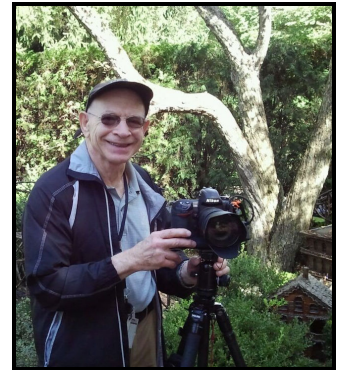
Bill Bishoff Volunteer Garden Photographer